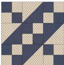
12 1/2" unfinished block