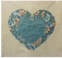
February – Raggedy Hearts

Directions for the Block of the Month are on our website: http://newtownquiltersguild.org/bom.shtml