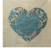
February – Raggedy Hearts