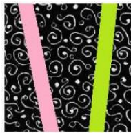
May - Celebration

Directions for the Block of the Month are on our website: http://newtownquiltersguild.org/bom.shtml